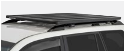
SX (Sports Bar)*