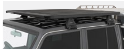
RL (Gutter Mount)

It is important to know exactly how much load you can carry. Please check your vehicle user manual for your vehicle's load carrying capacity and go to www.rhinorack.com/loadrating for further information.