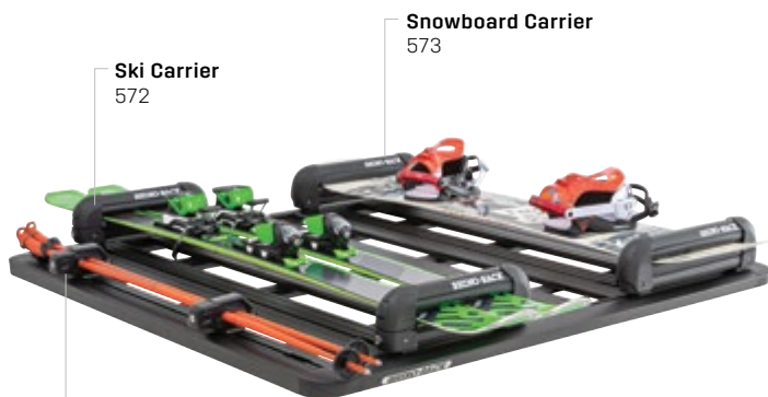
Ski Carrier 572