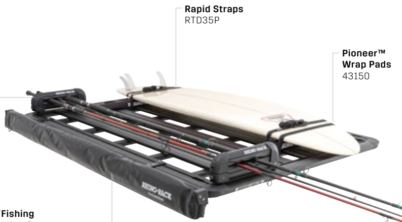
Ski/Fishing Road Carrier 572