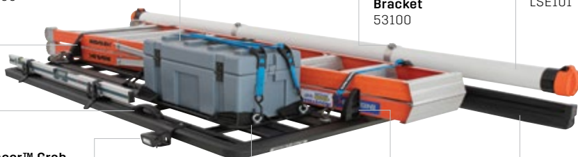
Pioneer™ Grab Handles 43245