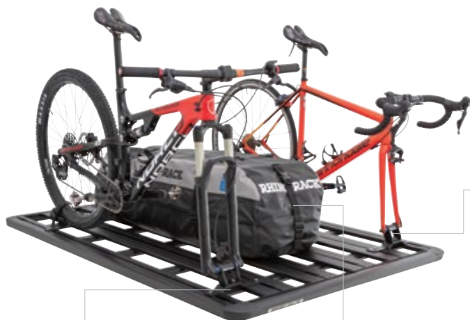
Thru Axle Bike Carrier 43233