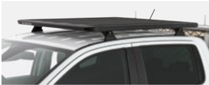
RCH & RCL